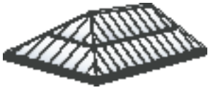
RIDGE (WITH HIPPED ENDS)