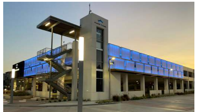
Backlit polycarbonate façade for Foothill Transit

For an extra layer of security, translucent polycarbonate screen walls can be backlit to transform a structure at night. . Polycarbonate is an excellent choice for backlit glazed façades because of its light diffusing qualities, color brilliance, low flammability, and insulating value.