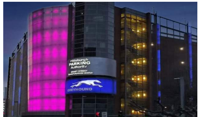
Backlit polycarbonate façade for Pittsburgh Greyhound garage