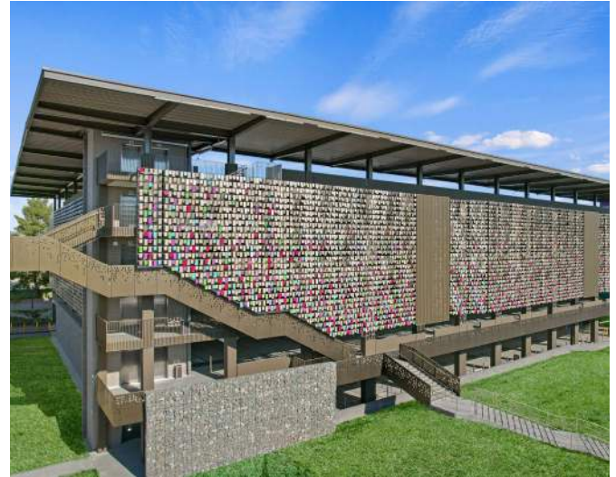
KINETICWALL for parking structure at City of Hope Duarte

Made of "flappers" attached to stainless steel rods, the KINETICWALL responds to wind currents and ripples to create the look of rolling waves. The system is customizable and can be designed to accommodate square or curved polycarbonate, glass, aluminum, or steel flappers, and can be finished with color-shifting paint. The KINETICWALL is structurally designed to withstand hurricane-force winds, and uses spacers designed to prevent collateral noise from flappers. The KINETICWALL allows facilities to meet ventilation codes while providing solar screening.