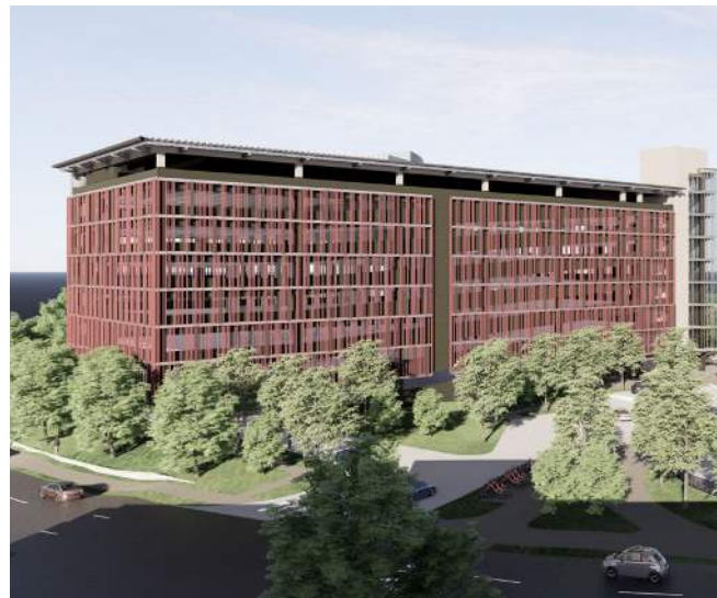
Custom engineered metal façade finished to resemble terracotta

We have used GEOLAM to emulate the appearance of bamboo in a parking structure, and used other materials to customize parking facilities, bringing to life an architect's vision.