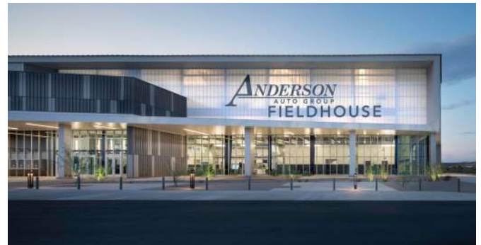
LIGHTWALL 3440 at Anderson Fieldhouse in Bullhead, AZ

Whether retrofitting a structure or designing for new construction, our translucent walls adapt to many environments. The lightweight panels and aluminum framing of our prefabricated systems allow for easy, quick installation.