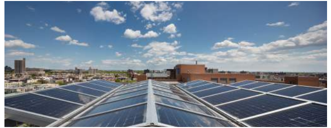
SKYGARD 2500 for green space in NYC

We have many skylight options to meet your design, from curved polycarbonate skylights to glass skylights. Our skylights are available in many different configurations and feature advanced framing and weather protection.