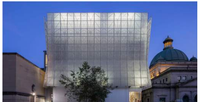
KINETICWALL at Pittsburgh Childrens Museum in PA