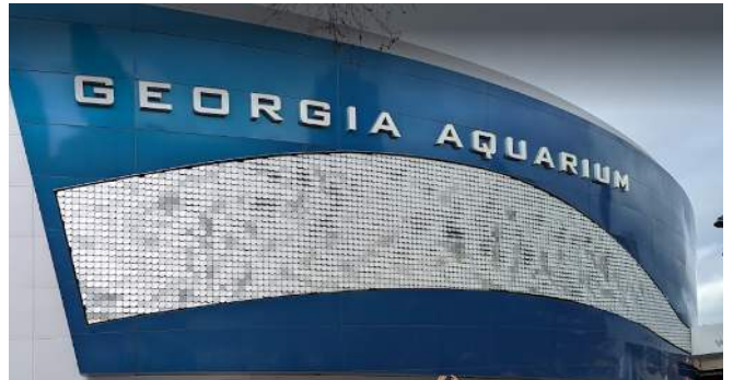
KINETICWALL at Georgia Aquarium in Atlanta, GA