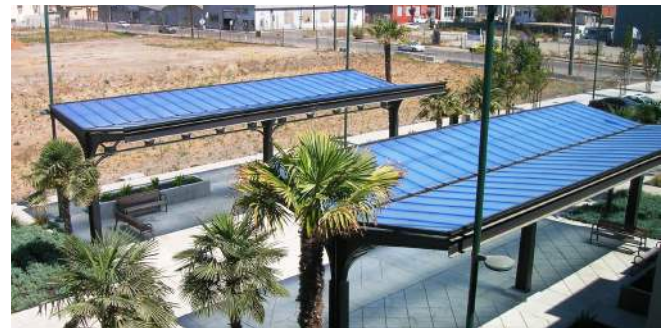
SKYSHADE 3100 at a park in CA