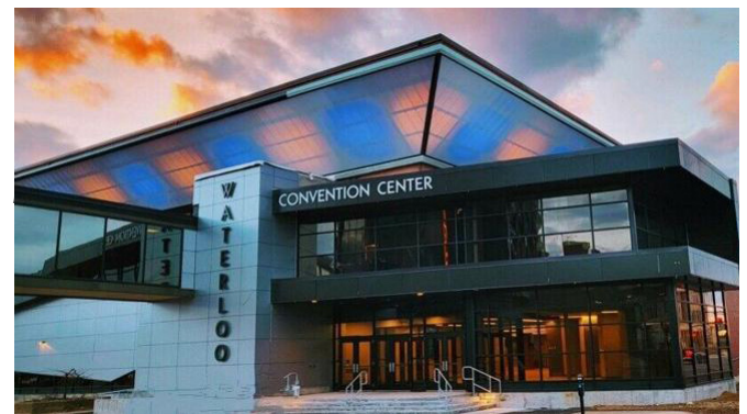
LIGHTWALL 3440 at Waterloo Convention Center in Waterloo, IA